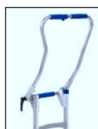
Fold Handle Type