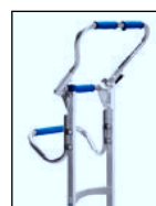
Uni Handle Type