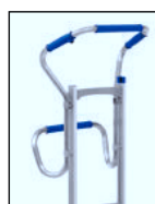
Ergo Handle Type