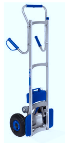
Fold-L Handle Type