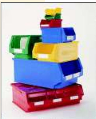
See page 82 for container dimensions.