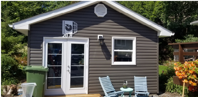
Our New Shop August 2020