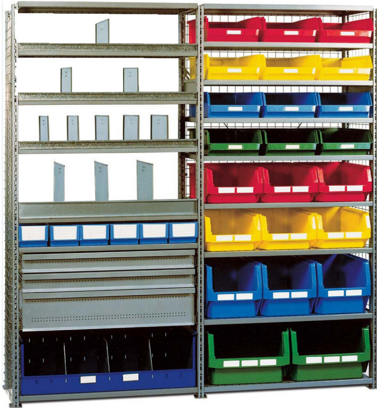
R3000 shelving shown with some accessories

Caster-Rack Systems is the Exclusive Stocking Distributor in Atlantic Canada for SSI Schaefer Systems International