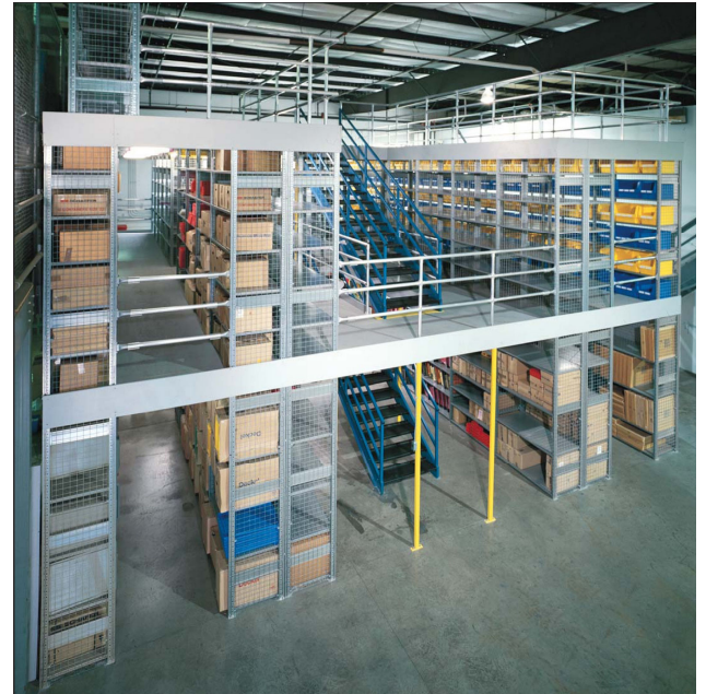
R3000 3 tier Mezzanine System

SSI Schaefer, headquartered in Germany, has been manufacturing the most flexible shelving systems for space Utilization on the market since 1937